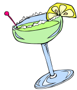
Bad Juans Rock!!

Wednesday, April 28 from 4-6 Elsa's Sports Bar—1216 Stroop Rd.